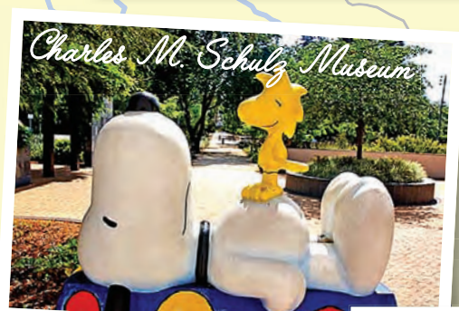
Charles M. Schulz Museum