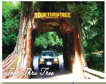
Tour Thru Tree