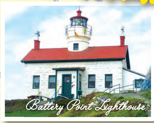
Battery Point Lighthouse