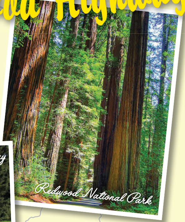
Redwood National Park