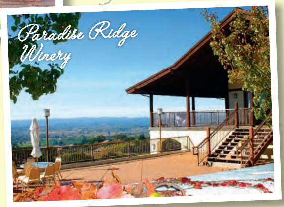
Paradise Ridge Winery