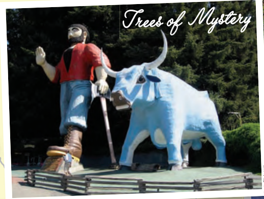
Trees of Mystery