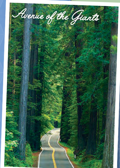
Avenue of the Giants