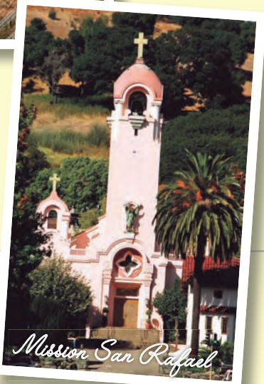
Mission San Rafael