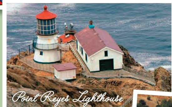
Point Reyes Lighthouse